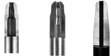
3/8" .080" WALL 3/8" .120" WALL 7/16" .165" WALL