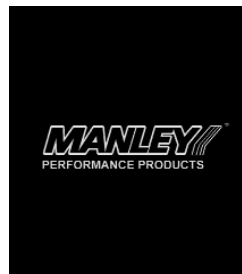
Front Left Chest Logo